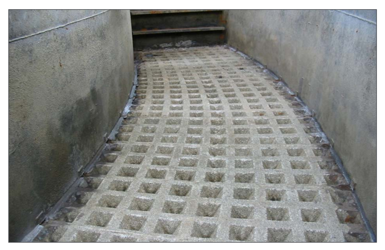
Filter and plenum prepared for Phoenix Panel installation

Upgrade of Existing Wheeler Bottom Underdrain System