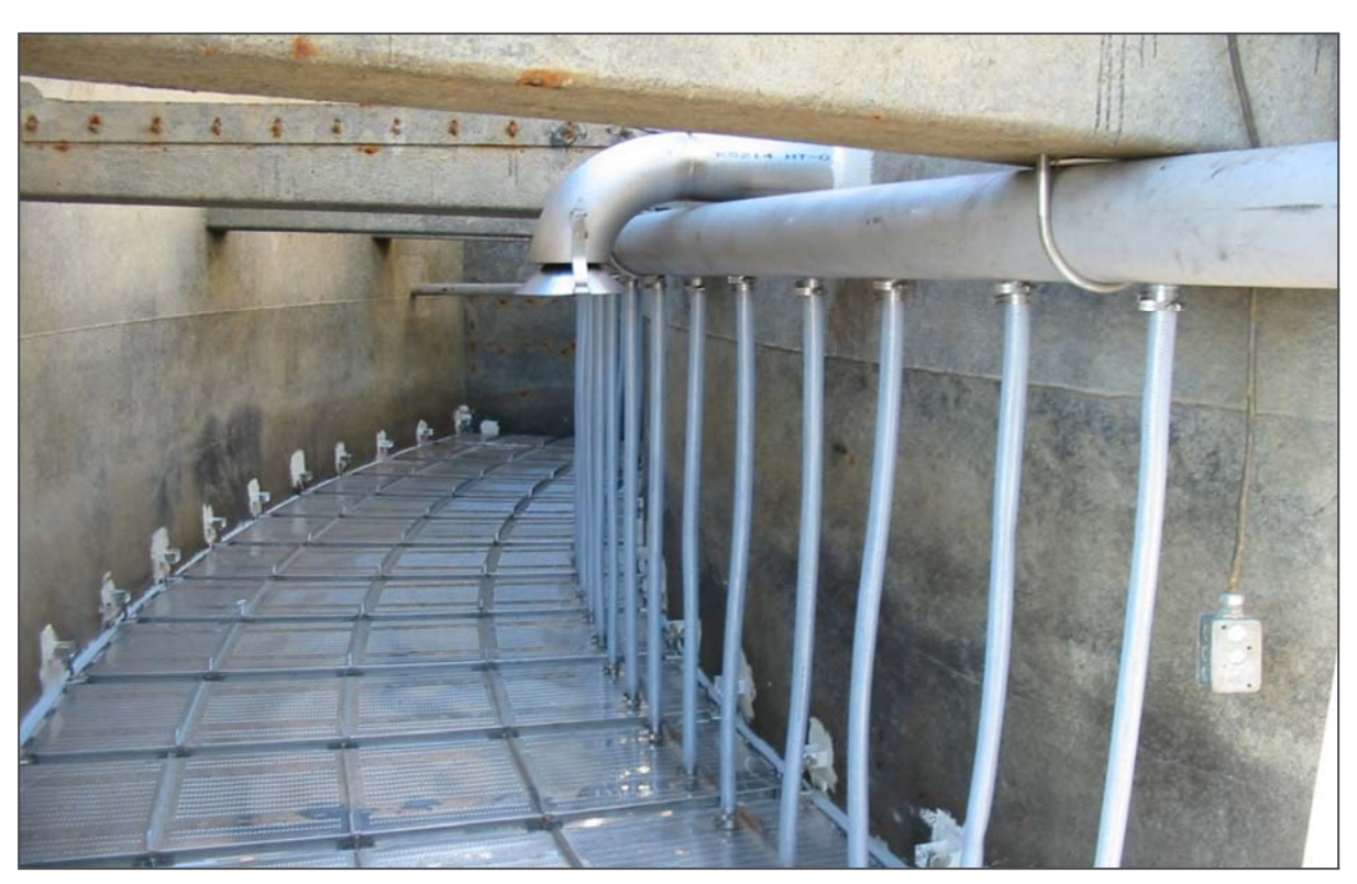
Air scour header connection to internal air conduit of Phoenix Panels