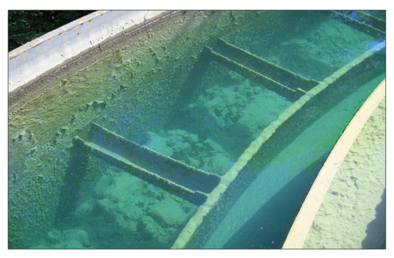
Condition of existing filter media bed