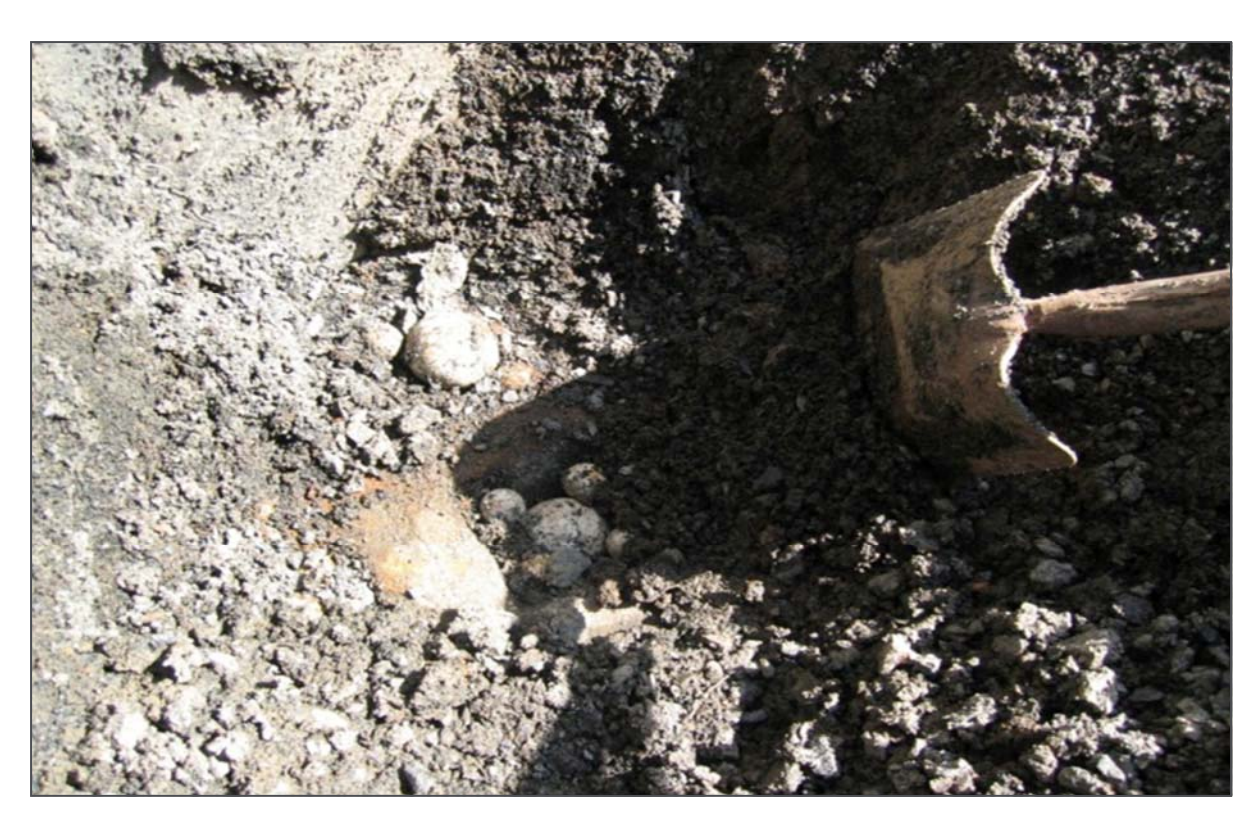
Existing Wheeler Bottom Underdrain