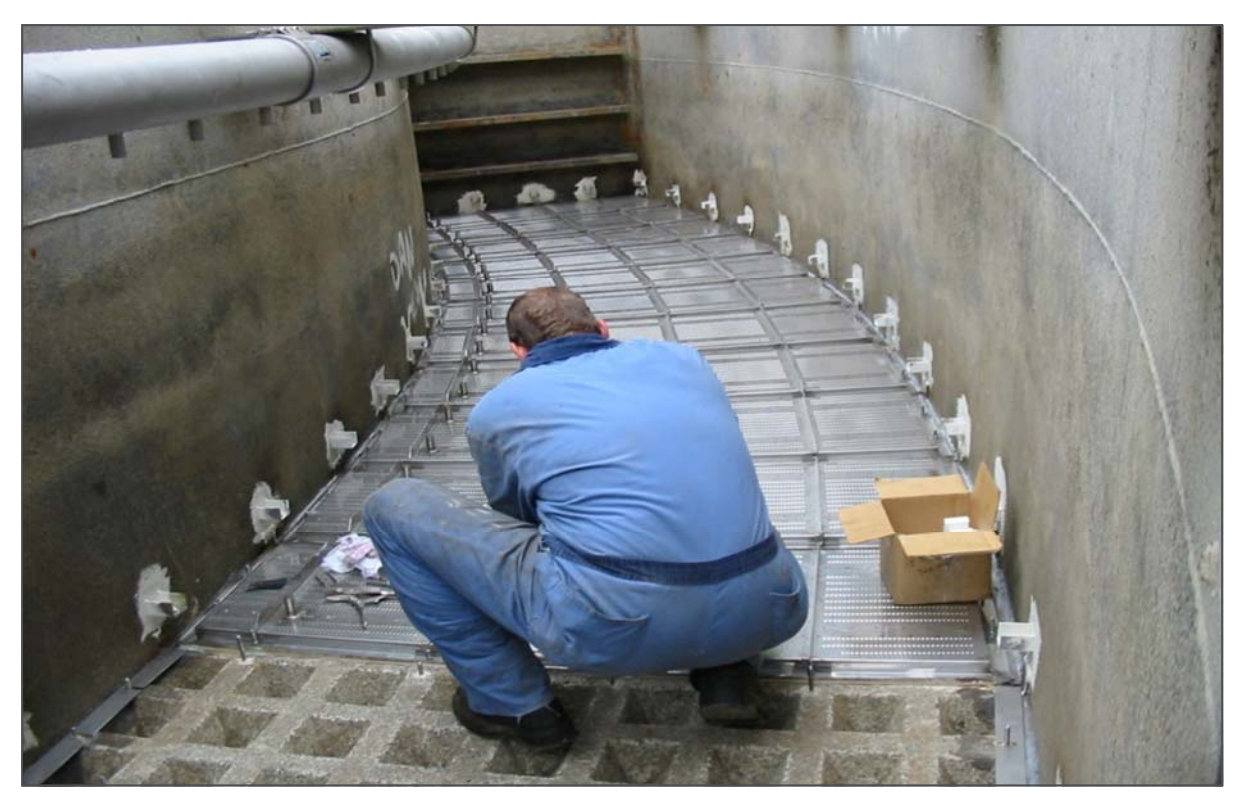
Installation of Phoenix Panel System

Upgrade of Existing Wheeler Bottom Underdrain System