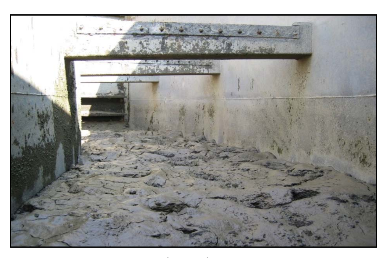
Condition of existing filter media bed