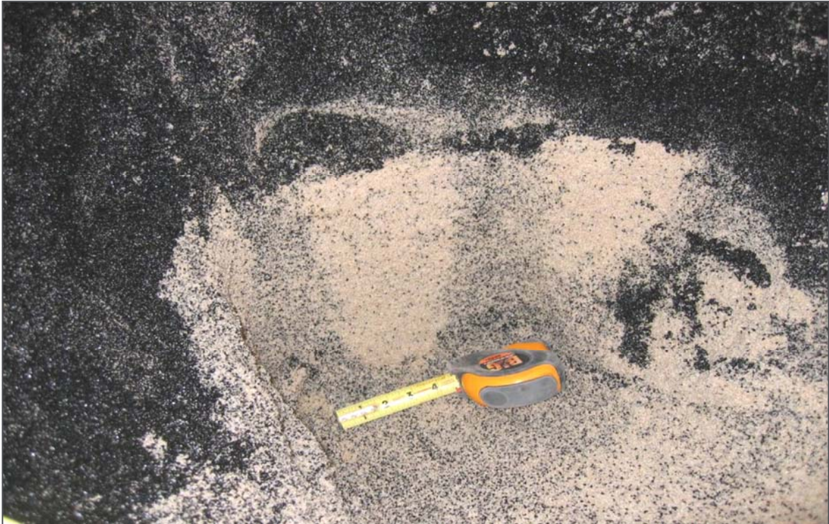
Filter media segregation due to backwash flow channeling through strainers