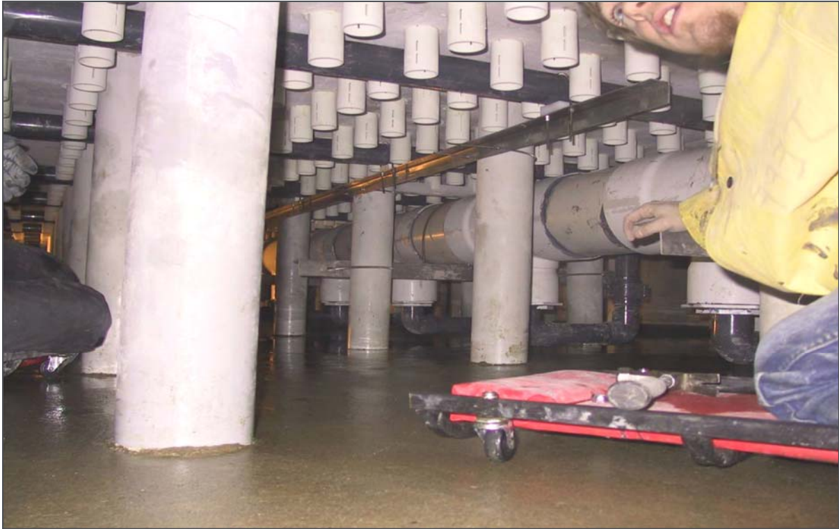
False bottom (plenum) area