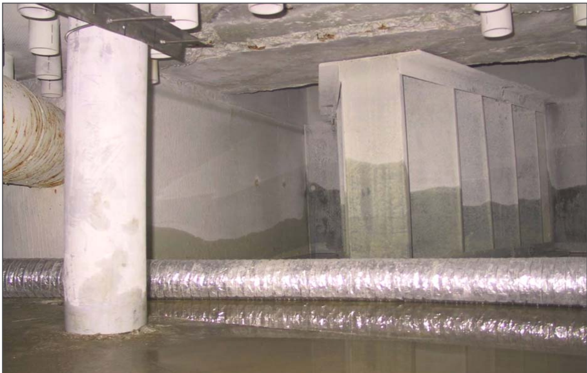
Existing backwash energy diffusion baffles