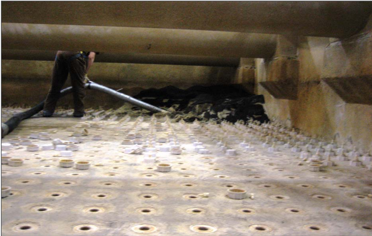
Removal of existing media and strainer nozzles