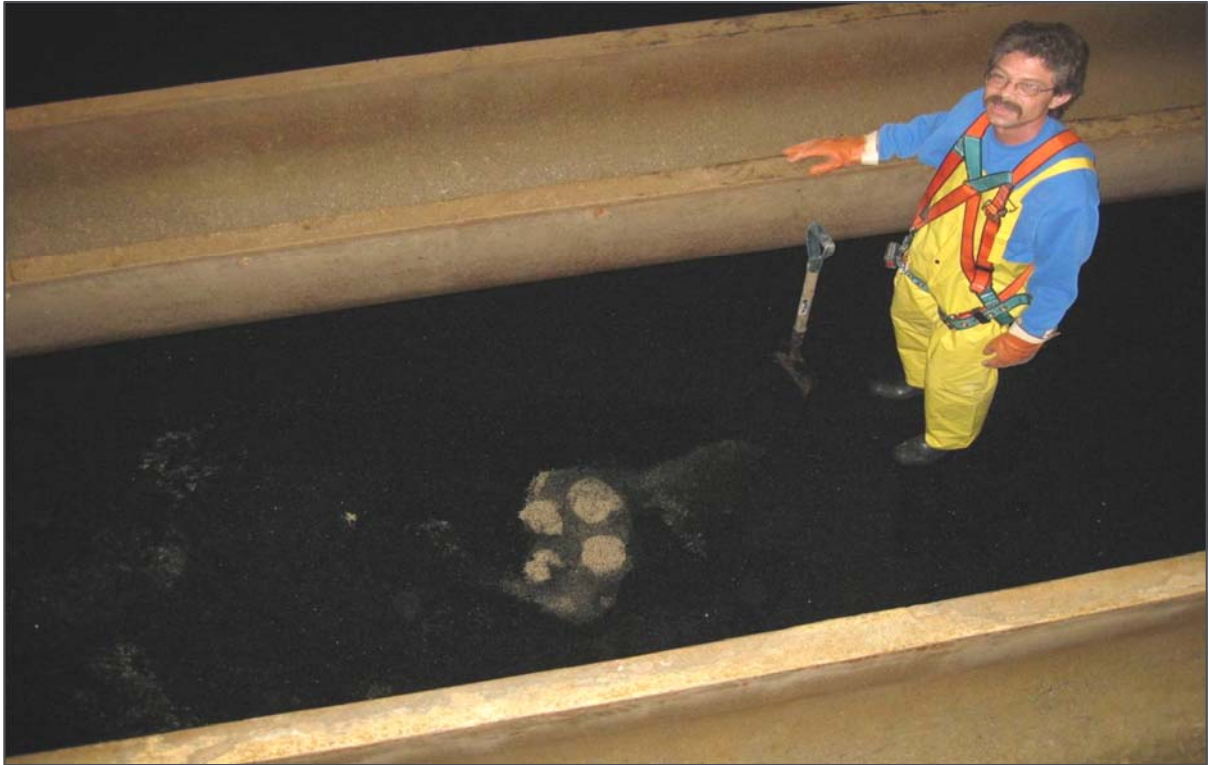
Filter media segregation due to backwash flow channeling through strainers