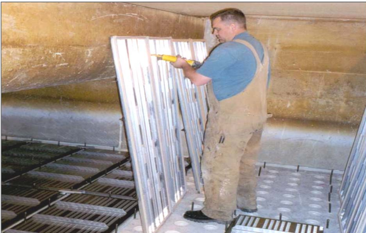
Installation of Phoenix Panels