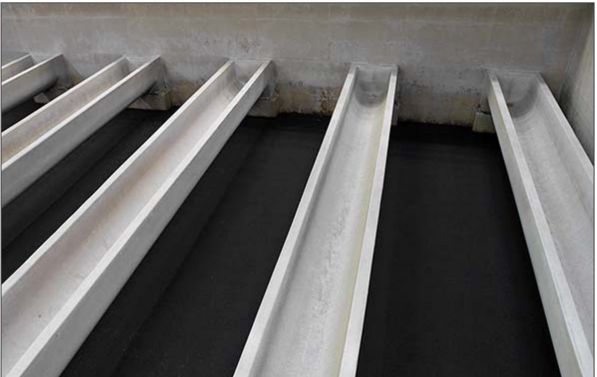
Puracite Filter Anthracite