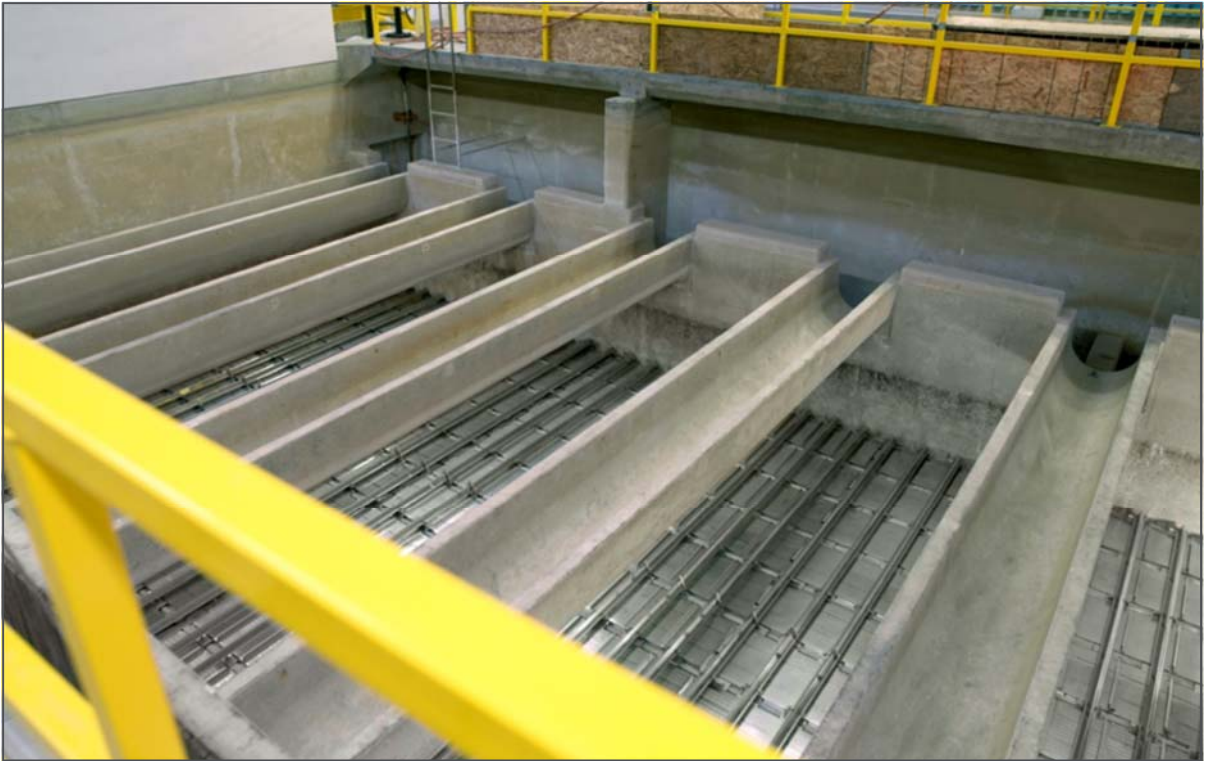
Completed Installation of Phoenix Panel and Air Scour Grid