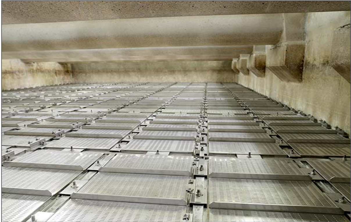
Completed Phoenix Panel Installation

Upgrade of Existing False Floor Underdrain System