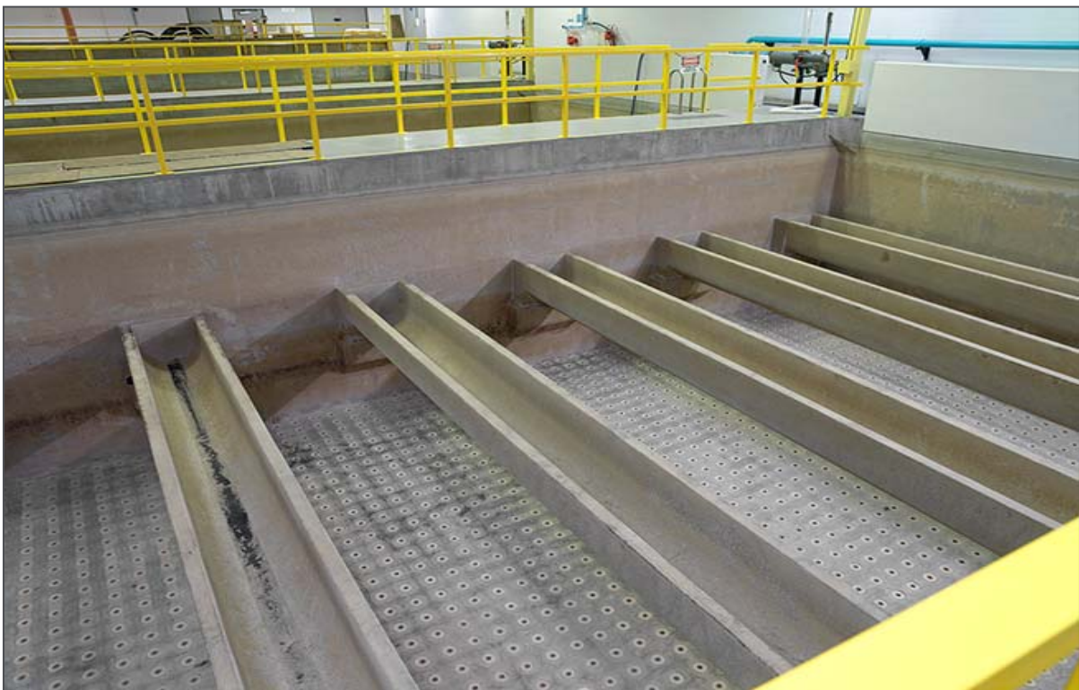
Empty filter cell