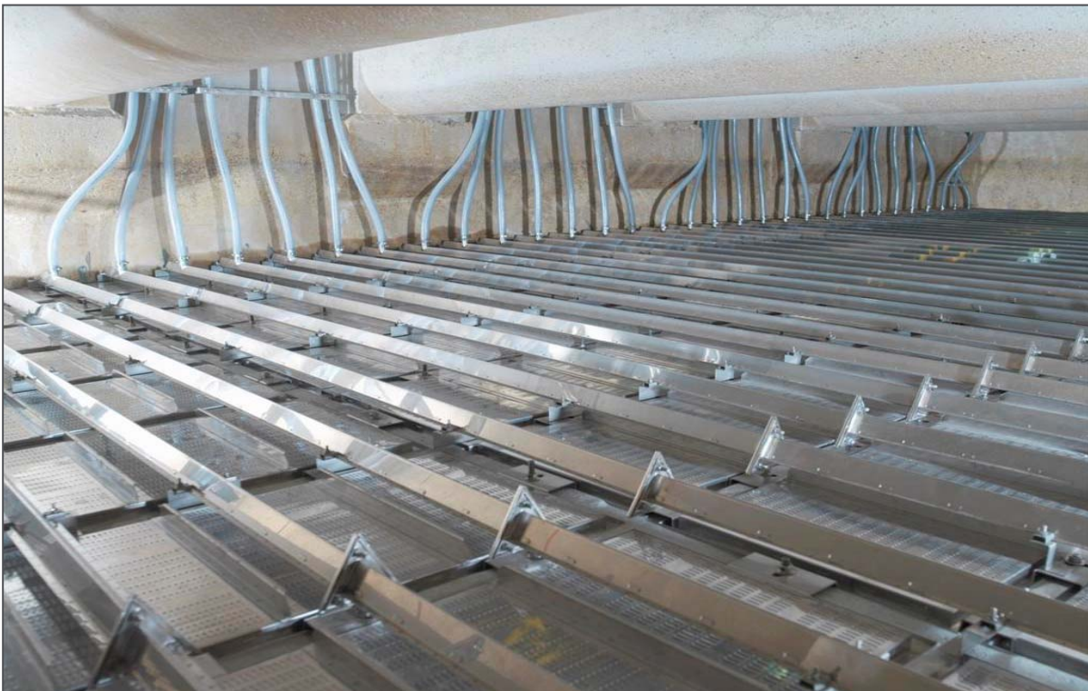
Completed Installation of Phoenix Panel and Air Scour Grid