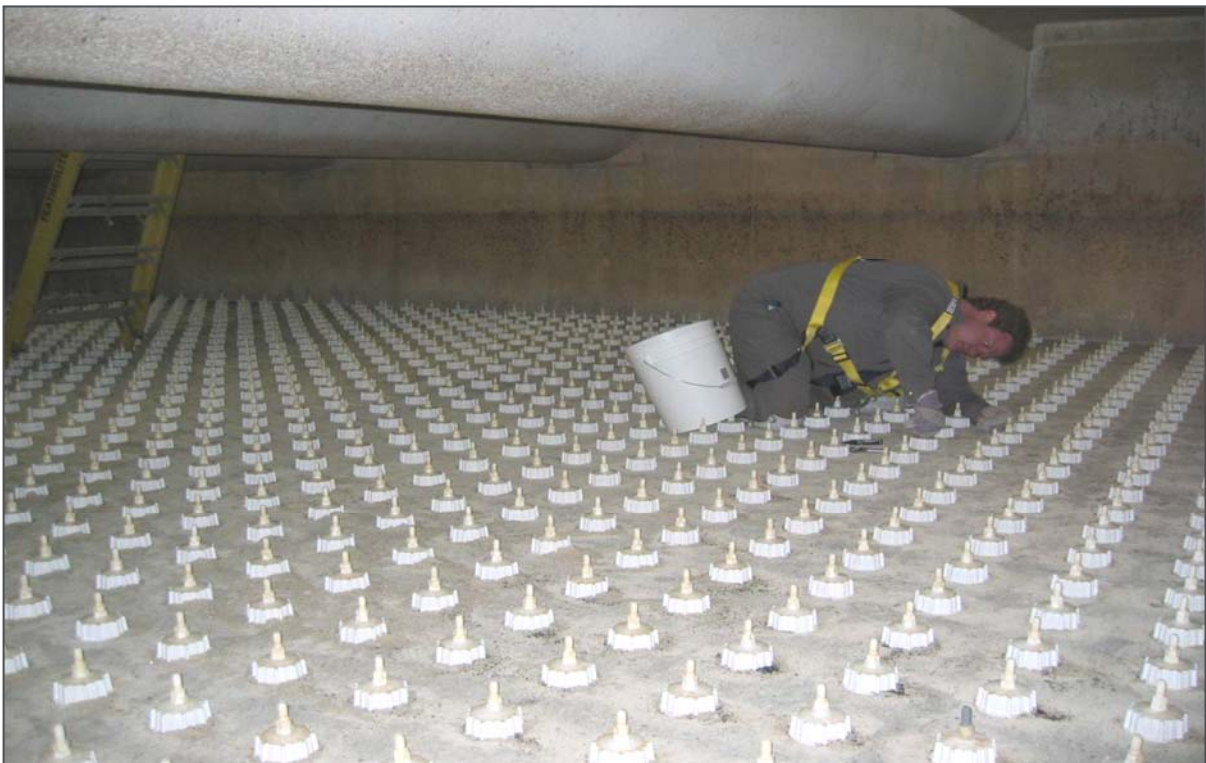
Existing strainer nozzles