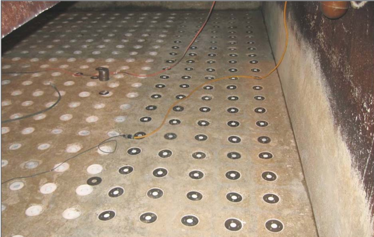
Backwash flow correction using variably-sized orifice plates